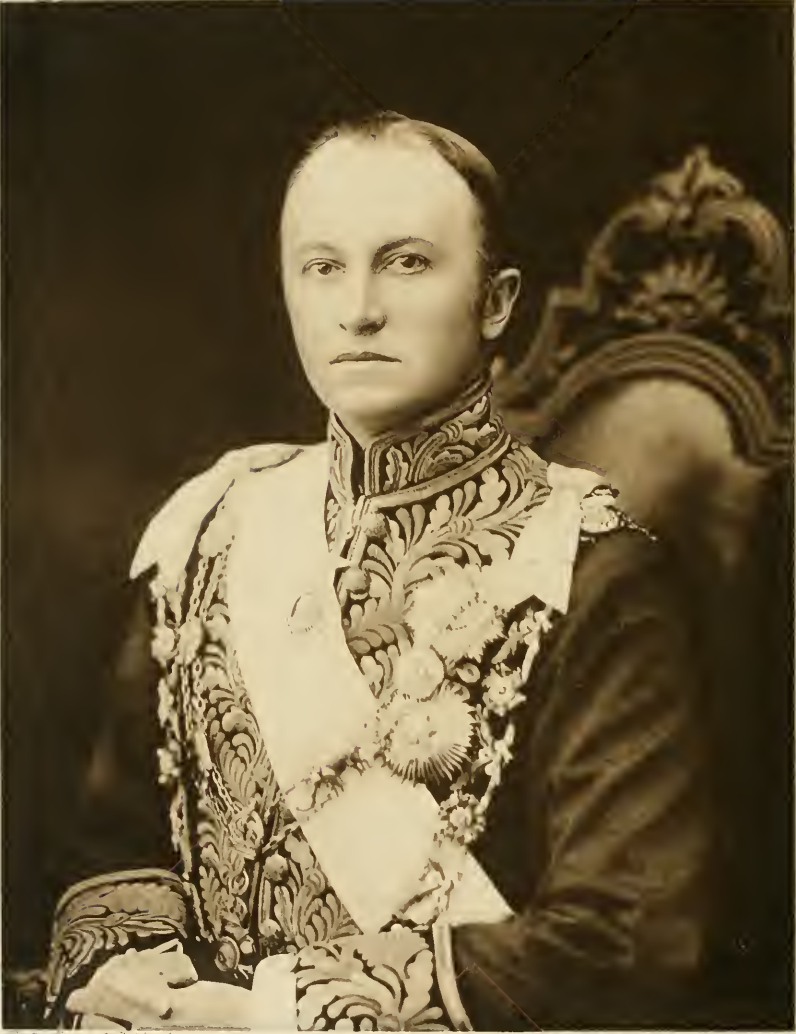
Lord Curzon as Viceroy of India.